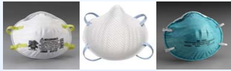
Figure 1. Examples of FFR.