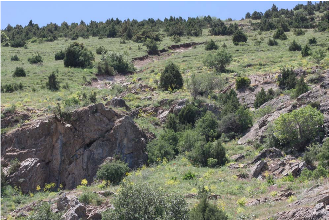
Fig.7 – Habitat of Graphosoma (Graphosomella) inexpectatum in Van Province (Turkey)