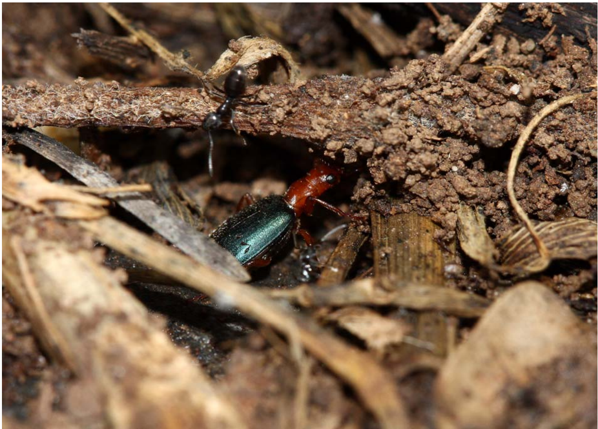
Fig. 8 – A Bombardier beetle ( Brachinus sp., Brachinini, Carabidae), N. Çatak, Elmacı 1750m, 28 2 2010