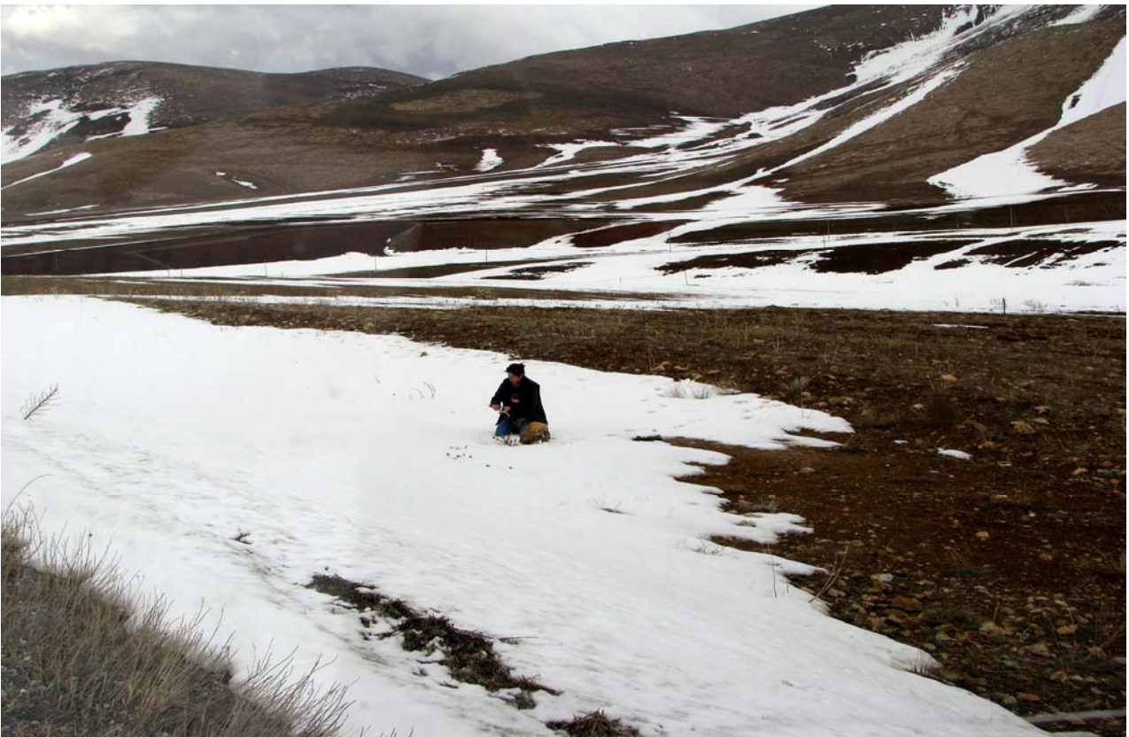
Fig. 2 – Hibernating place of Chionotopus humeralis (Malachiidae) at Çatak vic. Derebaşı 2175m, 28 February 2010 (Van Prov.), photo A.Ö.Koçak (Cesa)