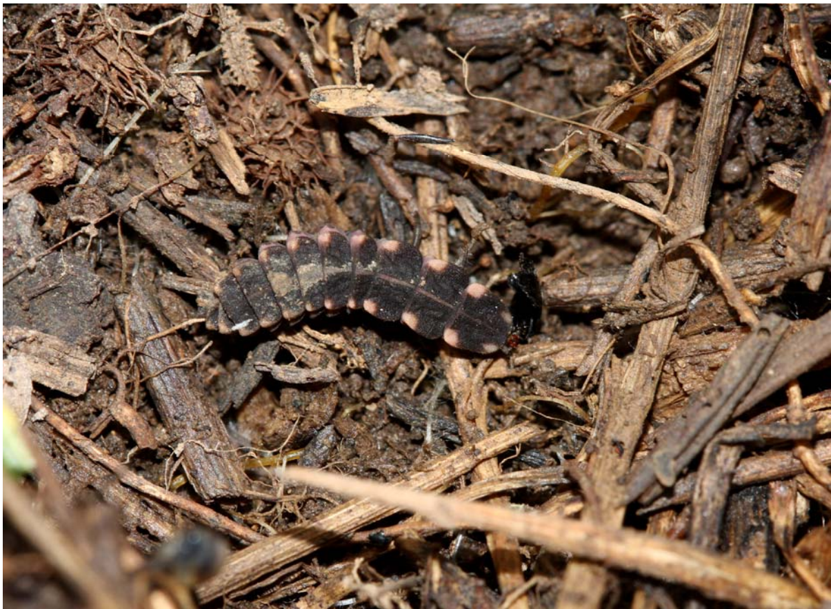
Fig. 6 – A lampyrid species in larval stage, N. Çatak, Elmacı 1750m, 28 2 2010