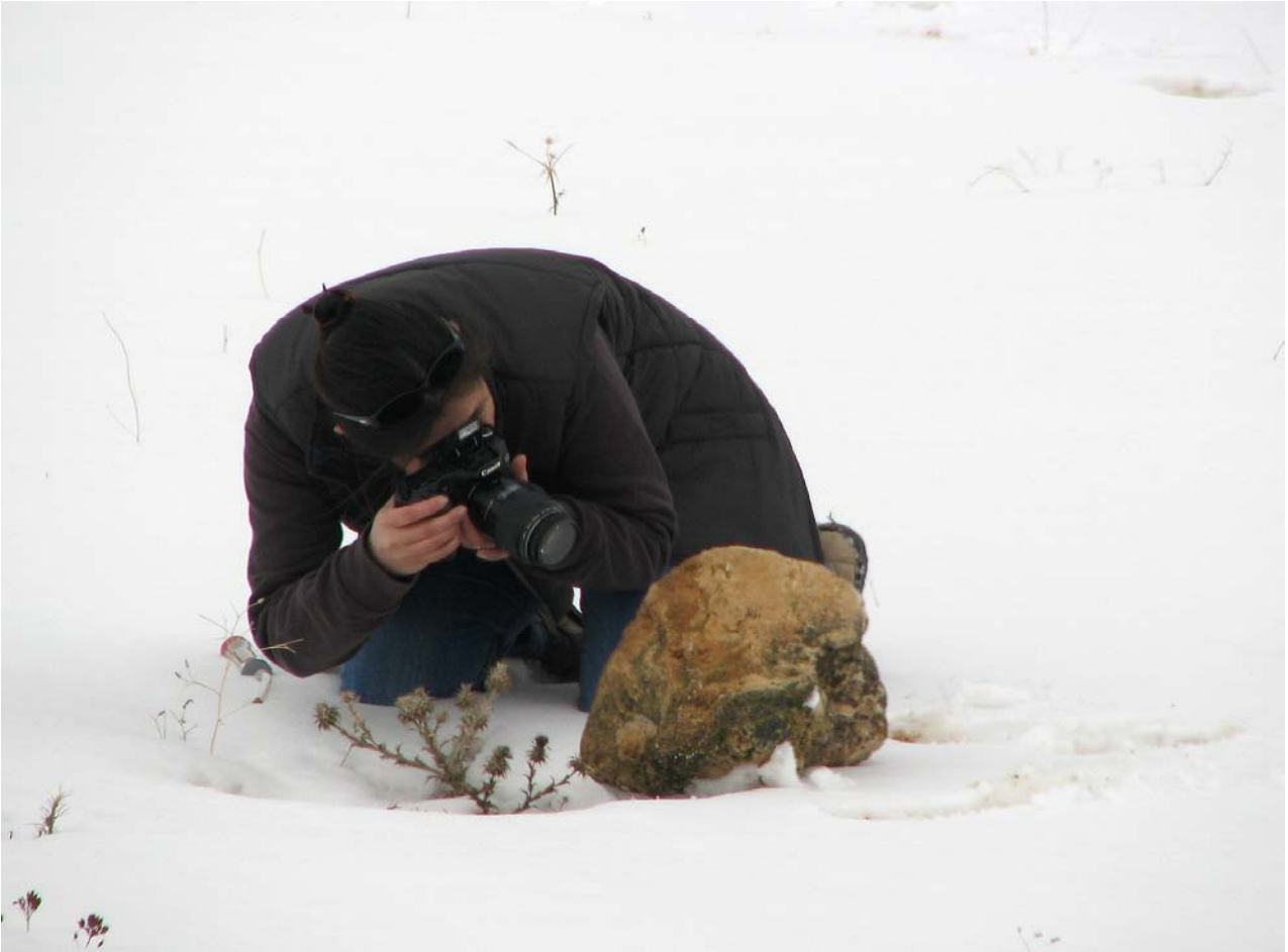
Fig. 1 – First author, during winter expedition of 2010 February to Çatak (Van Prov.), at the locality of Chionotopus humeralis (Malachiidae)