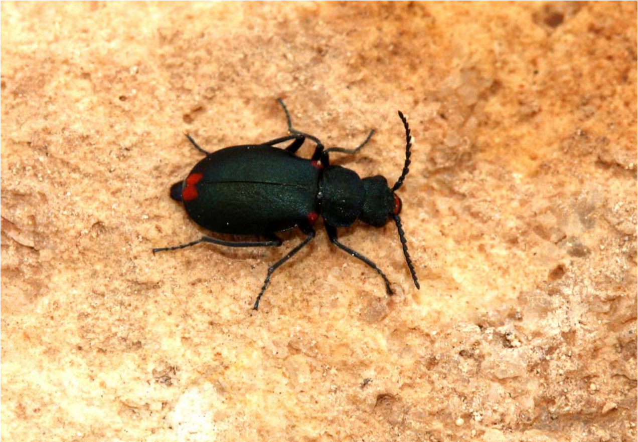
Fig. 3 - Chionotopus humeralis (Malachiidae) at Çatak vic. Derebaşı 2175m, 28 February 2010 (Van Prov.)