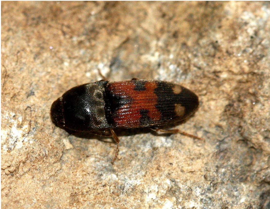
Fig. 4 - Drasterius bimaculatus (Elateridae) at Çatak vic. Elmacı 1750m, 28 February 2010 (Van Prov.)